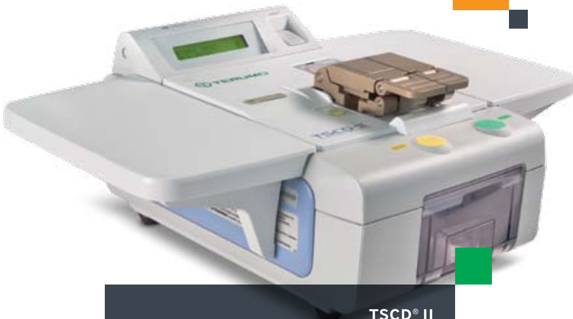
TSCD® II NEXT-GENERATION TERUMO STERILE TUBING WELDER