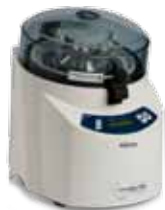
Precellys 24-Dual for flexibility

► Discover the other products of the Precellys range