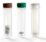
Lysing Kits consumables