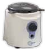
Cryolys for sensitive samples