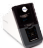
Minilys for personal use