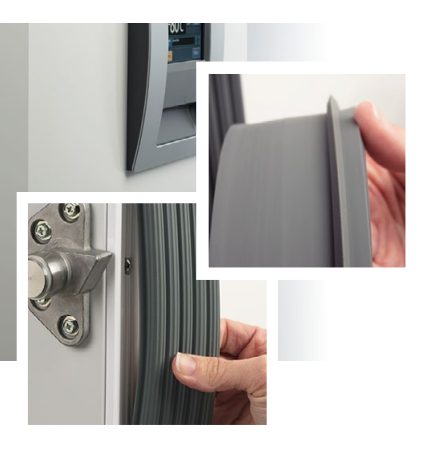
Multi-point door gasket is field replaceable without tools.